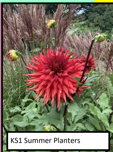
KS1 Summer Planters